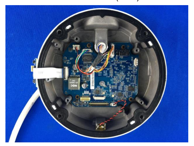
Visual check 2# (IPX7)