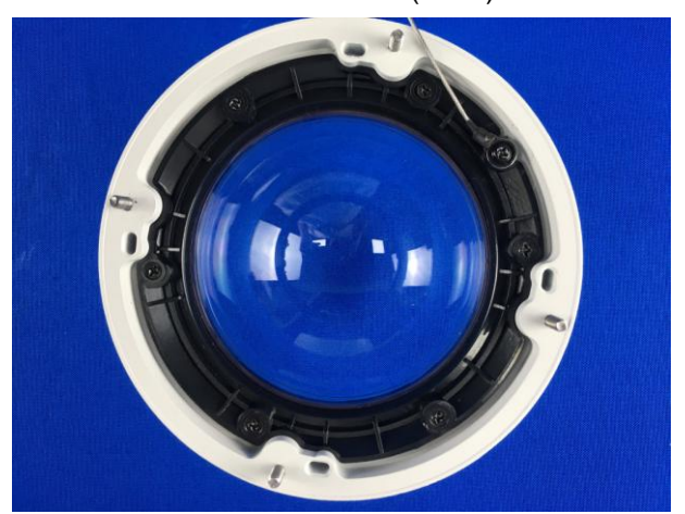
Visual check 2# (IPX7)