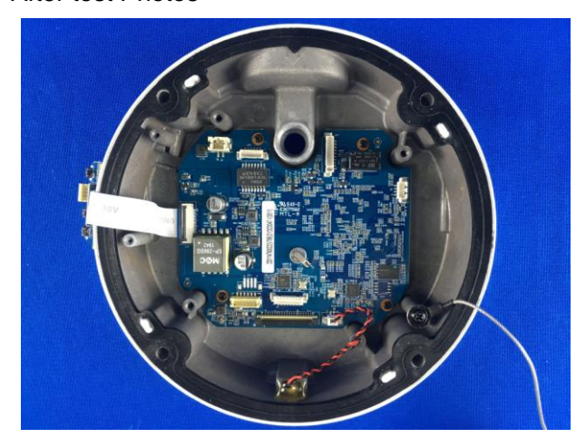
Visual check 1# (IP6X)