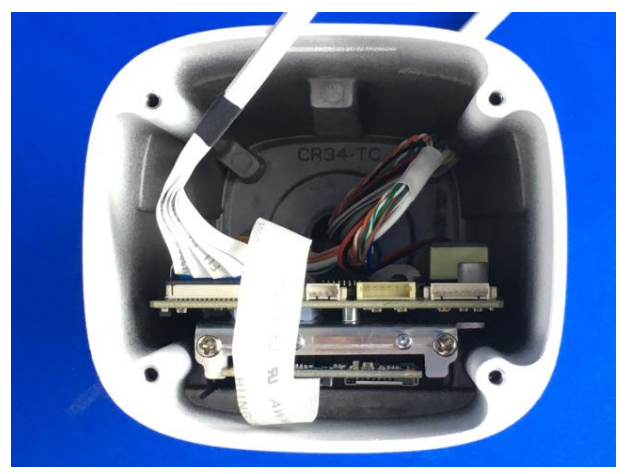
Visual check 2# (IPX7)