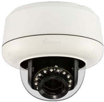
The Illustra cameras selected by Reflex Systems and WGSF allow school staff to see clear images even in low light conditions and without bandwidth concerns

One of the concerns that WGSF had before embarking on the project was making sure the school's bandwidth would be able to handle distribution of camera signals without disruption. Reflex Systems helped the organization's IT team design a solution that would work perfectly before installation of the security equipment. In addition, the Illustra cameras' bandwidthfriendly performance aided in making sure everything would go smoothly.