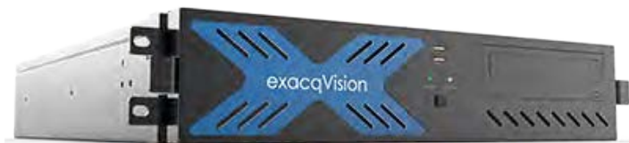
The exacqVision recorders with Kantech OnBoard enables the school to have quick access to critical access control commands, and can improve response time to alarms and events.

While the school has not yet integrated its access control system, the exacqVision Kantech Onboard combines the power of exacqVision recorders with an access control system within one recorder. exacqVision recorders with Kantech Onboard will enable WGSF to have quick access to the most needed access control commands. The integration of the two platforms on one system greatly improves response time to critical alarms and events.