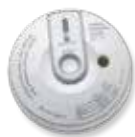
Carbon Monoxide (CO) Detector MCT-442