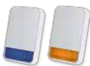
Outdoor Siren SR-740 PG2