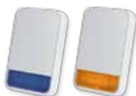
Outdoor Siren MCS-740