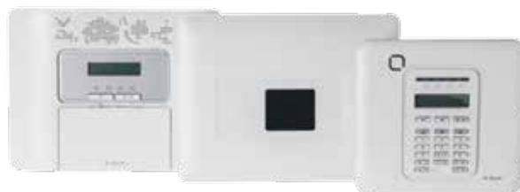
PowerMaster-30 64-zone control panel