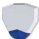
Outdoor Siren SR-740 HEX PG2