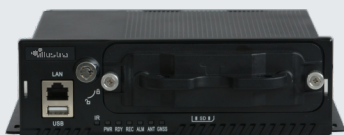
Illustra Standard Mobile DVR